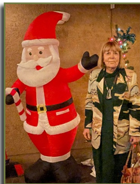
Our guest speaker for January when she attended our Christmas dinner in December.