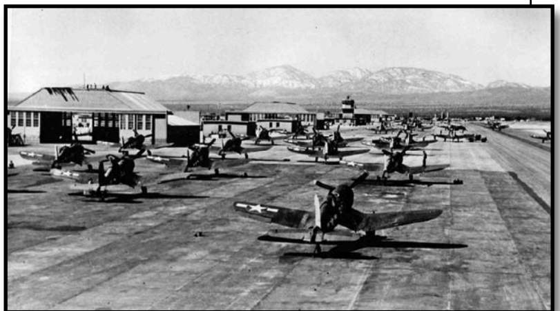
The flight line of the Mojave Marine Auxiliary Base, now part of the Mojave Air and Space Port. ( http://www.desertnews.com/news/article_4af73fd0-40cf-11ec-8f1a-9765b3028092.html )

Before the Mojave Marine Base job was finished, Pickus had also welded the reinforcing structure of the munitions storage dumps and kept the big Barber-Greene paving machine running as well as the other repair work.