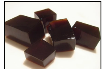
Pieces of grass jelly cut into 1 cm cubes.

while all Jello is considered a jelly, not all jelly can be called a Jello." ( https://clockworklemon.com/is-jello-the-same-as-jelly/ ).